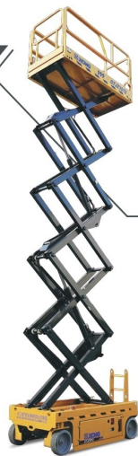
GTJZ1012/1212/1412 作业曲线图 Work Curve Graph

The modular design for the machine guarantees the universality of parts, makes the customers' repairs and maintenance easier, and achieves more competitive cost.